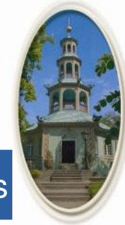
Restaurant & Café Drachenhaus im Park Sanssouci